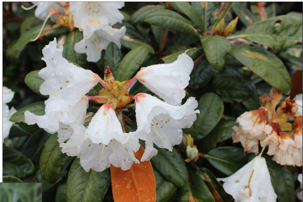
'Teddy Bear'

The door prize Rhodo for the June picnic will be R. 'teddy bear'.