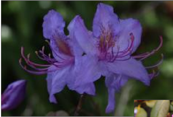
R. augustinii 'Playfair'