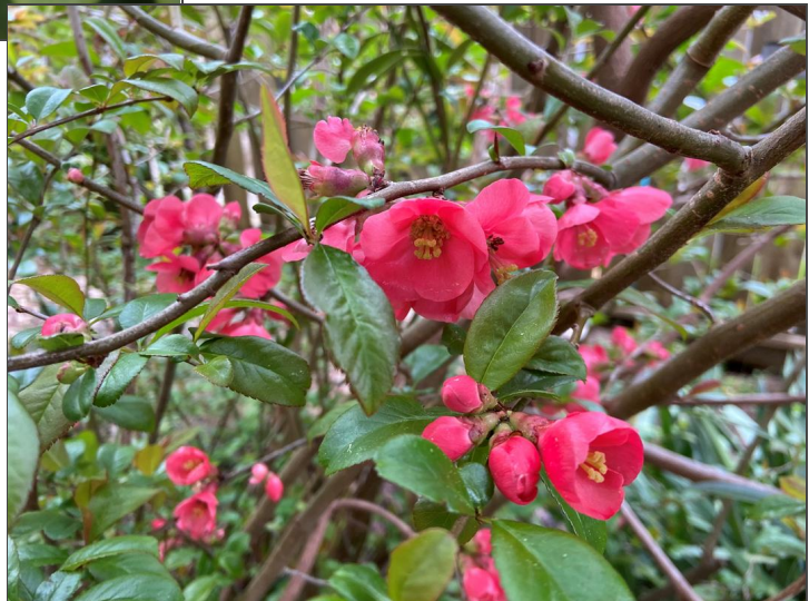
Chaenomeles X superba