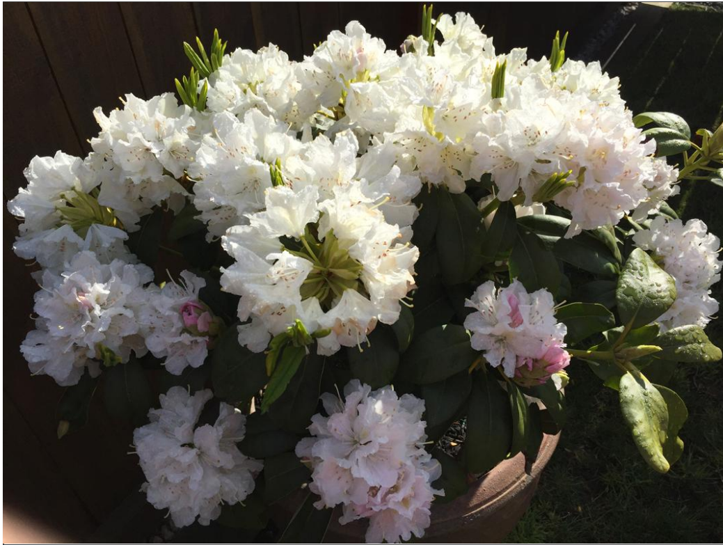
'Victorias Consort'