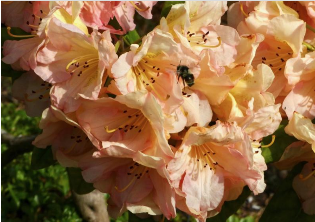
'Hello Dolly' (top) and 'Medusa' (bottom)

This year's theme will be "Your Garden and Climate Instability." Save the date; details will follow.