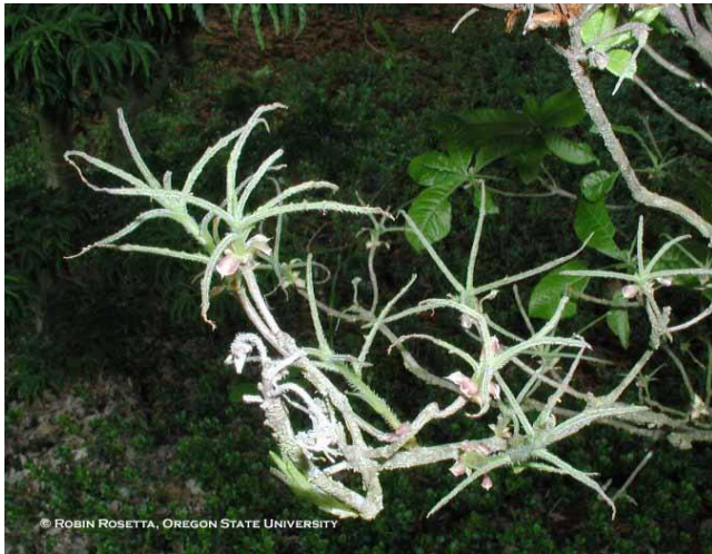
Fig. 1 Sawfly larva damage of Azalea