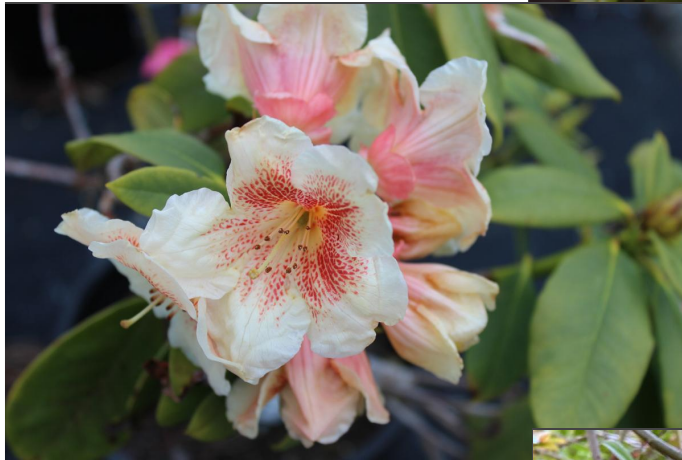
'Paprika Spiced'