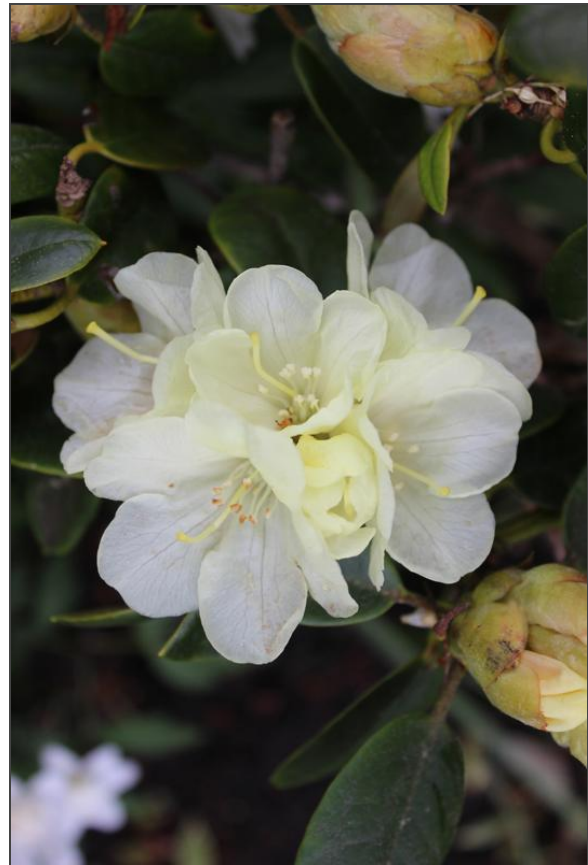
'Lemon Dream' (above) photo by Dave Godfrey, 'Yellow Hammer' (below) photo by Garth Wedemire

Follow us on Facebook: North Island Rhododendron Society