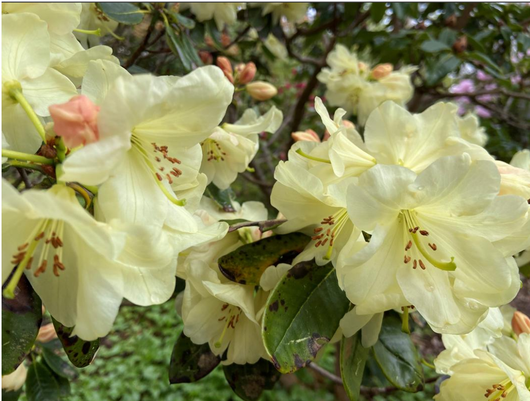
'Haida Gold'

June 25 Summer Picnic @ Chester’s Garden 4:00 pm