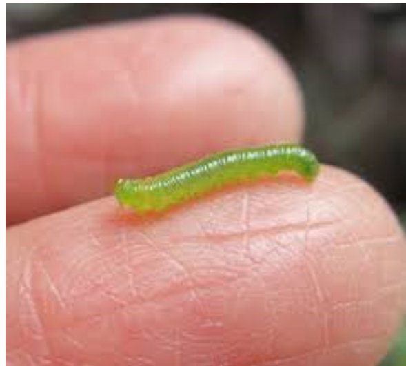
Fig. 2 Sawfly larva

And it looks like a little green caterpillar, so you rush off to get environmentally-friendly BtK. Sorry, it won't work. This little green "caterpillar" is a sawfly larva (Fig. 2). While caterpillars are the young of moths and butterflies ( Lepidoptera ), sawflies (not really flies either) are wasps ( Hymenoptera ). BtK only works on Lepidoptera .