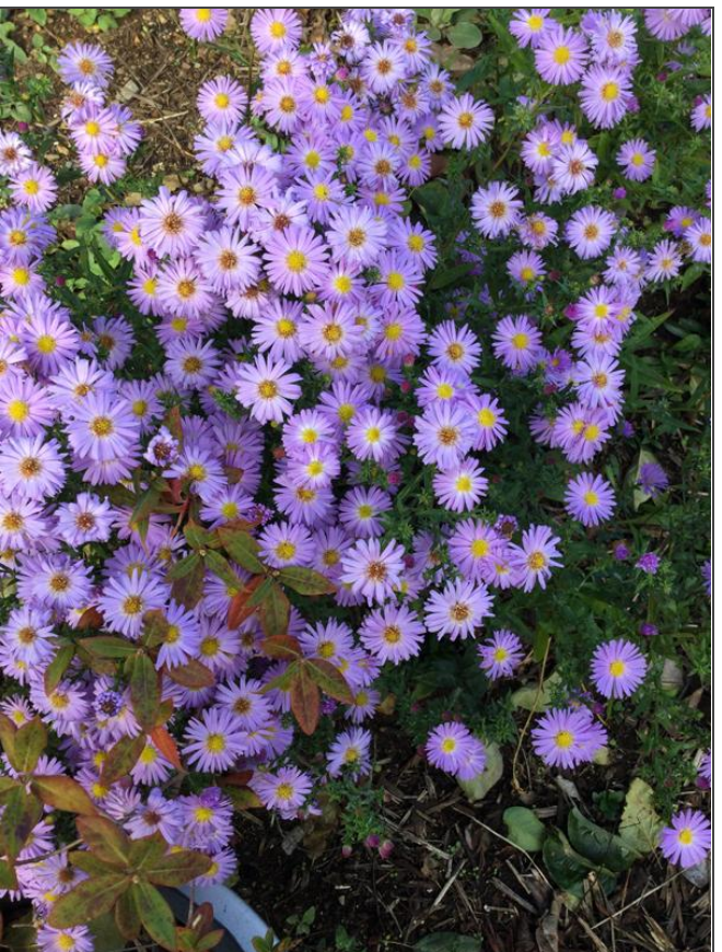
Fall Aster

In the meantime, please continue to stay safe and enjoy the many benefits of belonging to the NIRS.