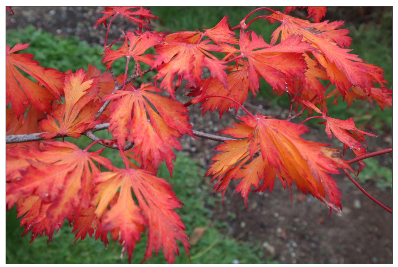
Acer japonicum 'Aconitifolium' ('Dancing Peacock') by Garth Wedemire