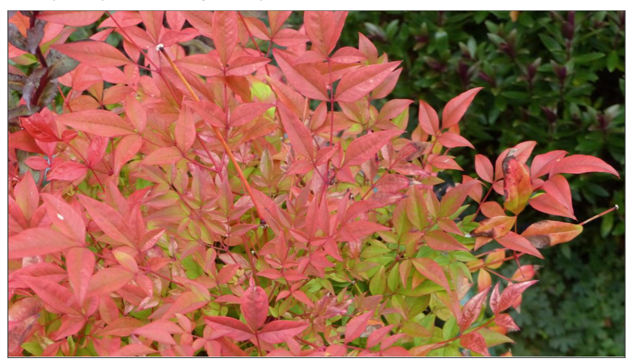
Nandia 'Gulf Stream'

Thank you for your continued generosity!