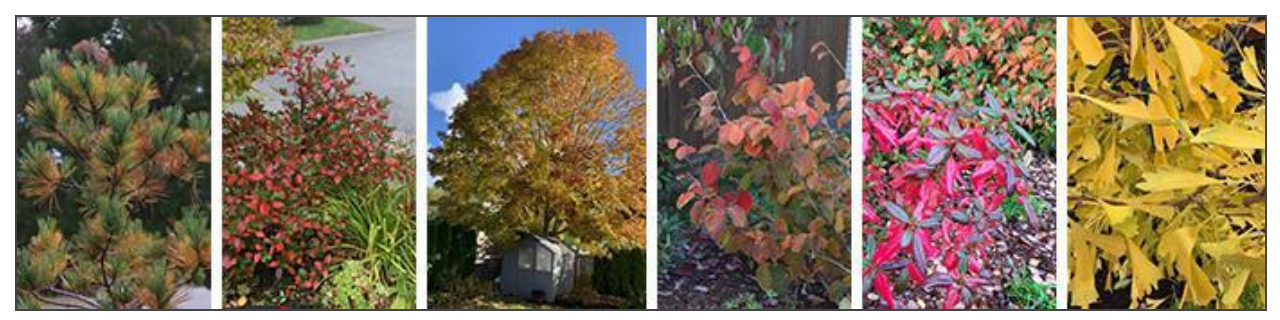
Photos above are in our Fall Colour 2021 Album (listed from left to right): Pinus strobus (Eastern White Pine), R. 'Bubblegum', "Ash Tree in My Backyard", Hamamelis 'Jelena', Park border near The Wandering Moose Café in Cumberland, and Ginko biloba

It's Autumn now. The warm and vibrant garden colours of spring and summer are in our rearview mirror. But do not fear – brilliant fall hues are at hand to enchant and delight us. Rhododendron lovers are known for their ability to imagine beyond the stunning blooms of spring and consider the hidden potential within each plant – whatever its genus - for dazzling colour in the colder months of the year. Is it just me, or have you also noticed that nature's display garden is particularly eye-catching this Fall?