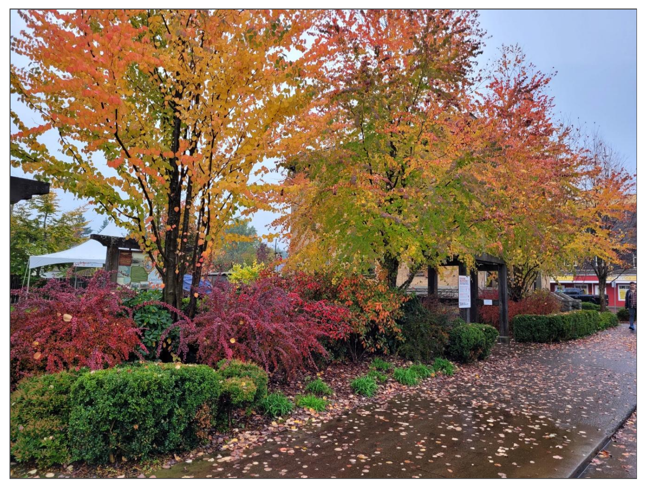
Fall Colours - Cumberland