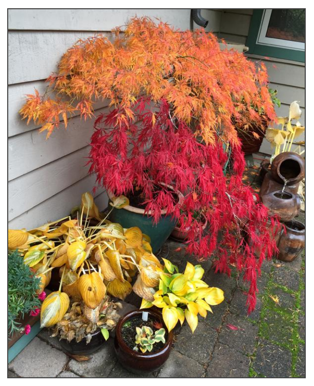
Acers & Hostas

Sedum 'Autumn Joy'