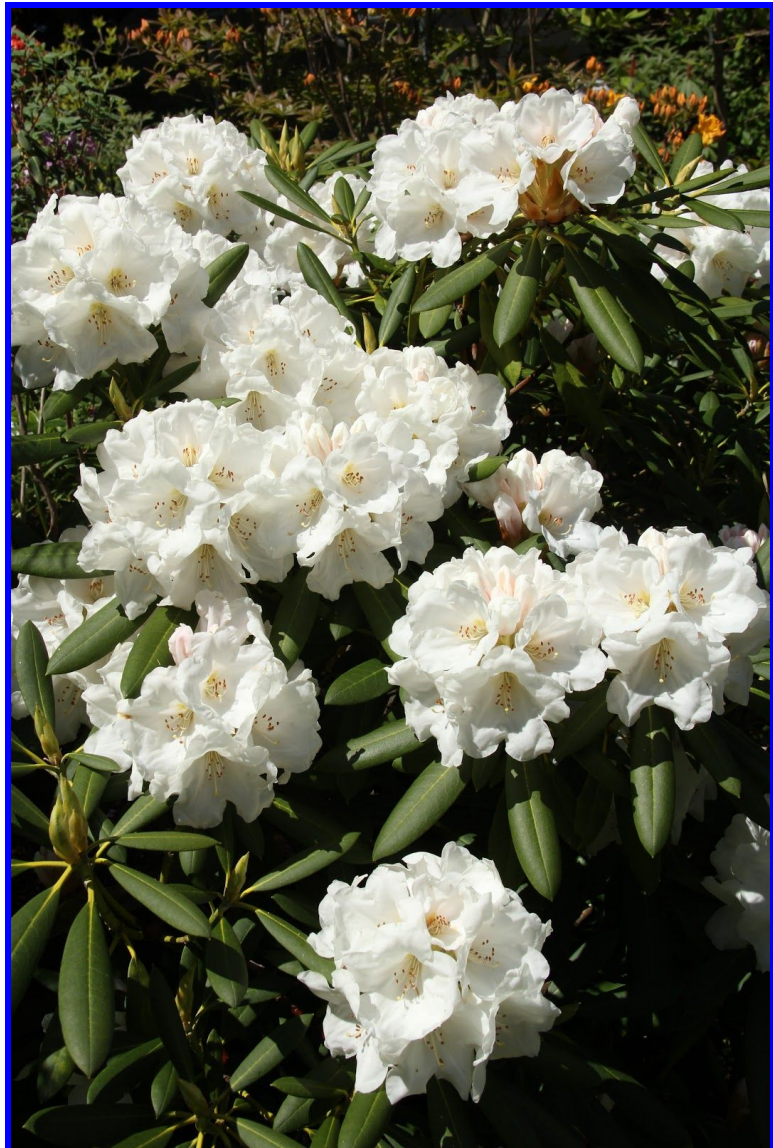
'Senator Jackson' May 2012 by Garth Wedemire