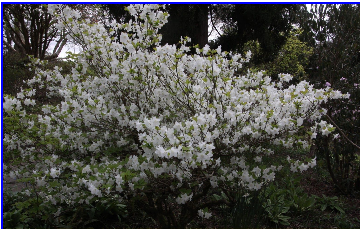
R. quinquefolium taken April 2018 at Bodnant Gardens, Taly'n Caf, Wales UK