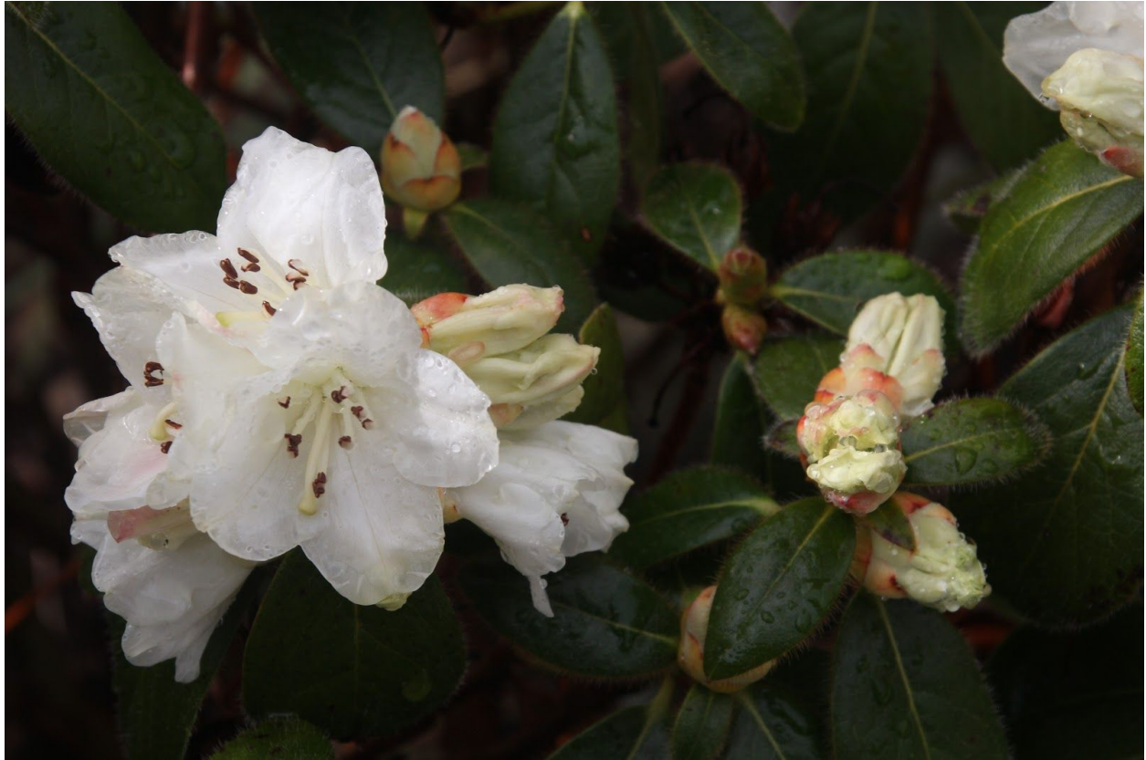
"Snow Lady" taken March 2020