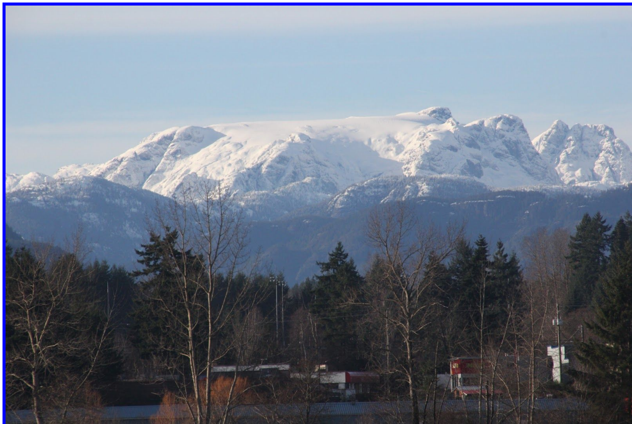
2015 Comox Glacier (Queneesh) and R. diversipilosum 'Milky Way'