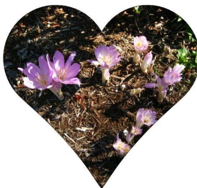
Bernie's fall crocus

The fall crocuses have suddenly appeared, and the slugs weren't far behind. There should be enough blossoms for all. The next gentian to blossom will be the Asian gentian. If you like blue flowers you may find some plants at garden club plant sales."