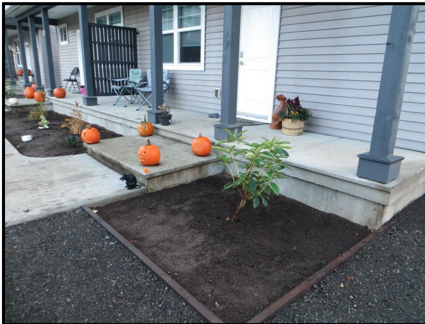
Rhododendron planted at Habitat's housing site.